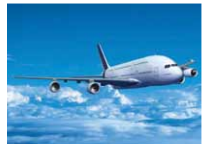
Accepted for use by major aircraft manufacturers.