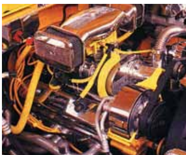
High thermal and chemical resistance and wide color/size selection make PET ideal for customizing and protecting the wires, hoses and cables in custom and classic cars.