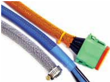
When cut with a hot knife, the sealed ends of PET allow for varied termination solutions.