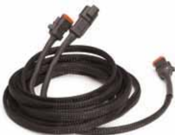
Flexo PET installs quickly in production harnessing environments, reducing assembly cost.