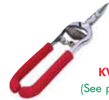
Kevlar Shears KVS0.00SV (See pg. 73)