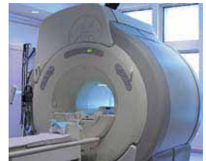
Vectran's molecular structure not only makes it one of the world's strongest materials but vectran is also invisible in MRI systems.

Vectran® is a registered trademark of the Kuraray Co., LTD.