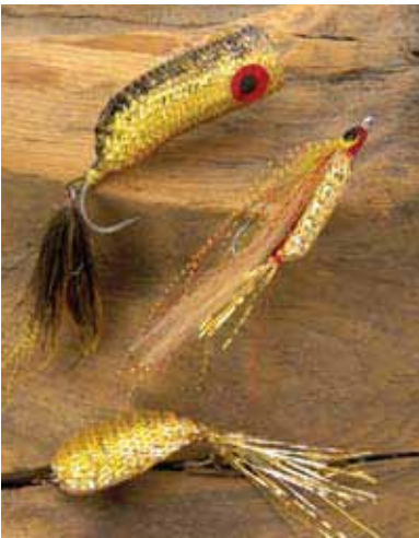
Light weight and economy make MY an ideal product for designing and tying fishing lures of all types and sizes. Several world records have been set with lures constructed with Techflex sleeving.