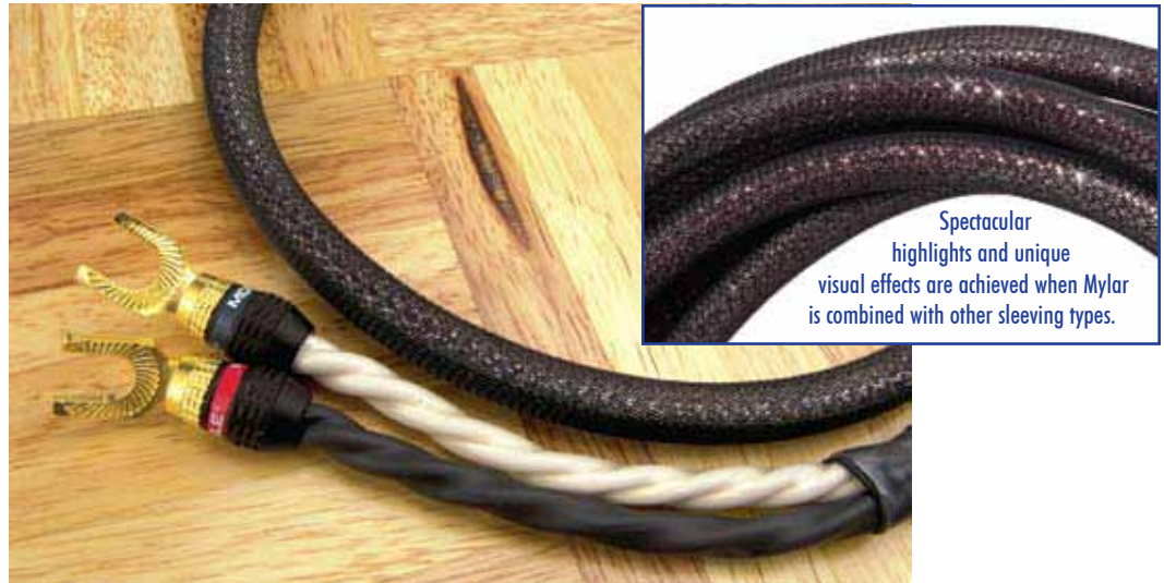
Spectacular highlights and unique visual effects are achieved when Mylar is combined with other sleeving types.