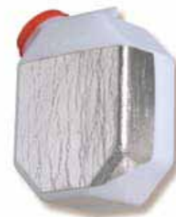
ThermaShield Flat conforms and adheres to irregular shapes.